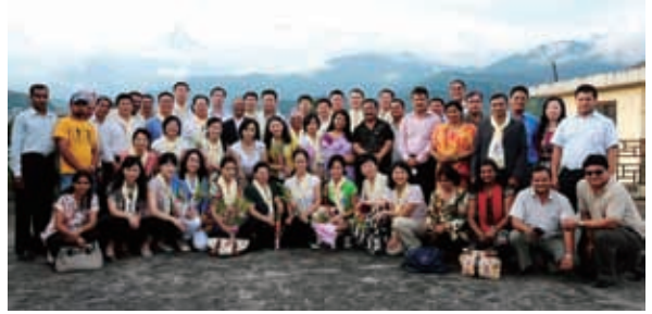
During July 16 and 21, Chinese Youth Delegation visited Nepal.