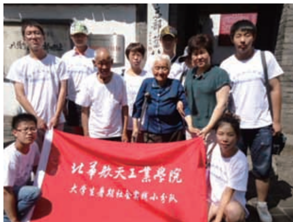
In July, the 2011 summer vacation social practice program started. Millions of college and secondary vocational school students head for rural areas, offering cultural, educational and medical services there. Picture shows students of Beihua College of Astronautics are visiting villagers who once delivered grain to the Eighth Route Army during the war.