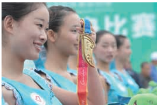
In September, 2011, some 75000 volunteers of Guizhou served in the 9th National Traditional Sports Meeting for Ethnic Minorities.