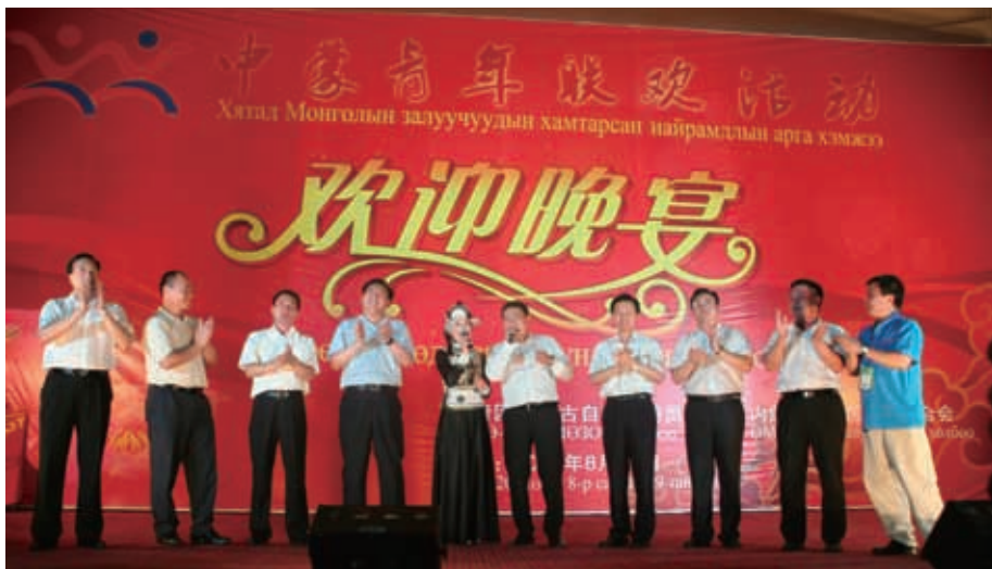
On August 29, Chinese and Mongolian youth gathered in Inner Mongolia.