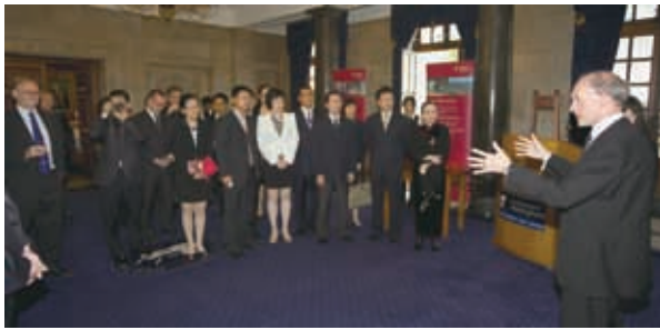
On July 29, representatives taking part in the Second Session of Chevening Youth Leaders Training Program visited the City Hall of Nottingham.