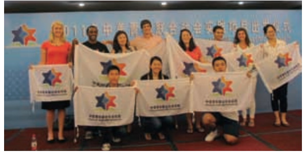
On August 26, the Sino–US Youth Joint Social Practice Program was launched in Beijing.