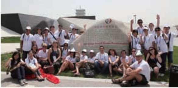
On July 7, Chinese and European youth were taking a photo in front of the “EU–China Youth Green Proclamation” .